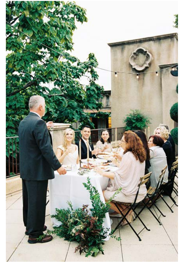
TERRACE AT PATIO DEL NORTE