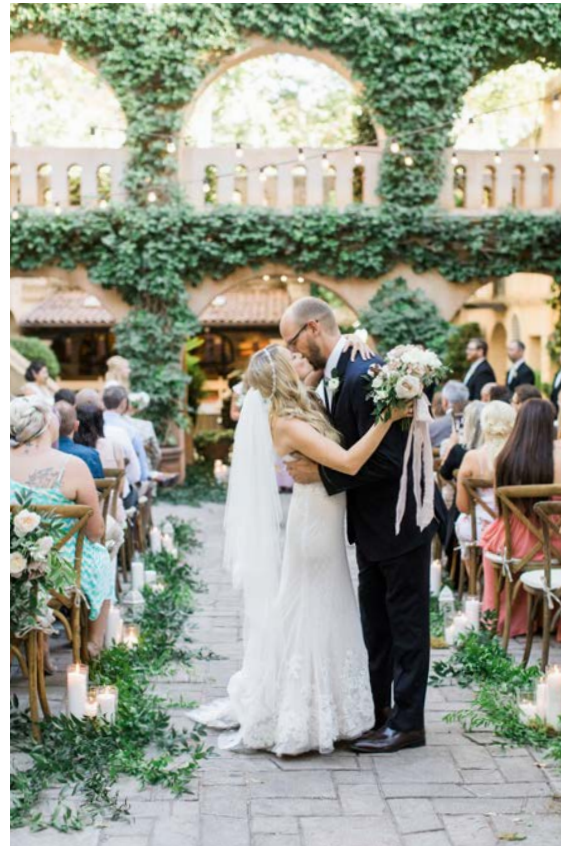
PATIO DE LAS CAMPAÑAS