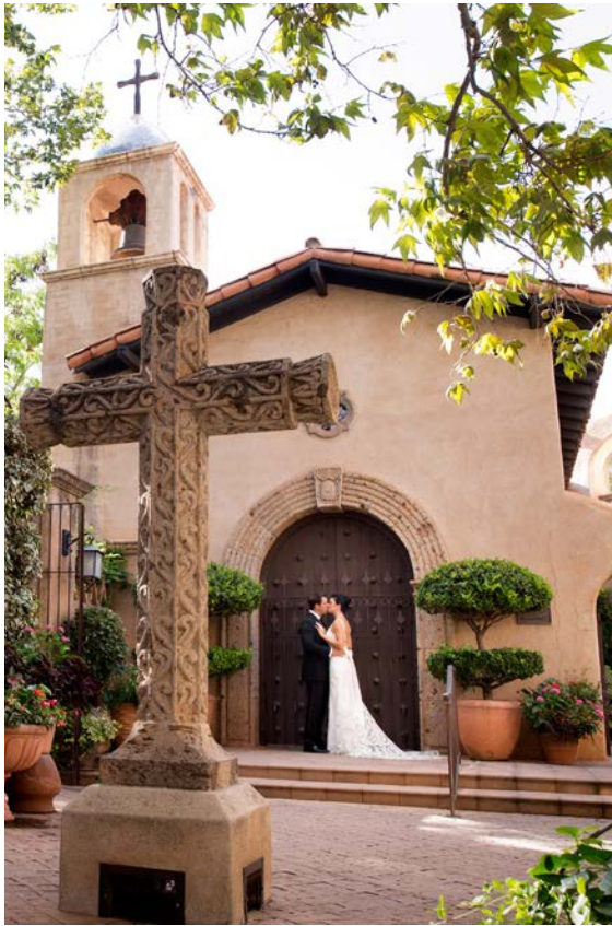
CHAPEL AT TLAQUEPAQUE